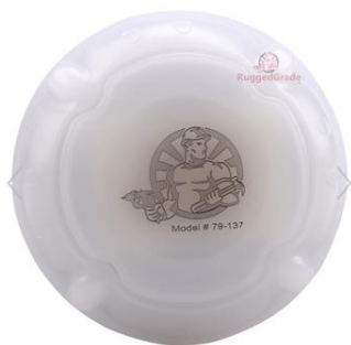
Rugged Grade Lighting Industrial Grade Solutions