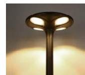
Dark test light