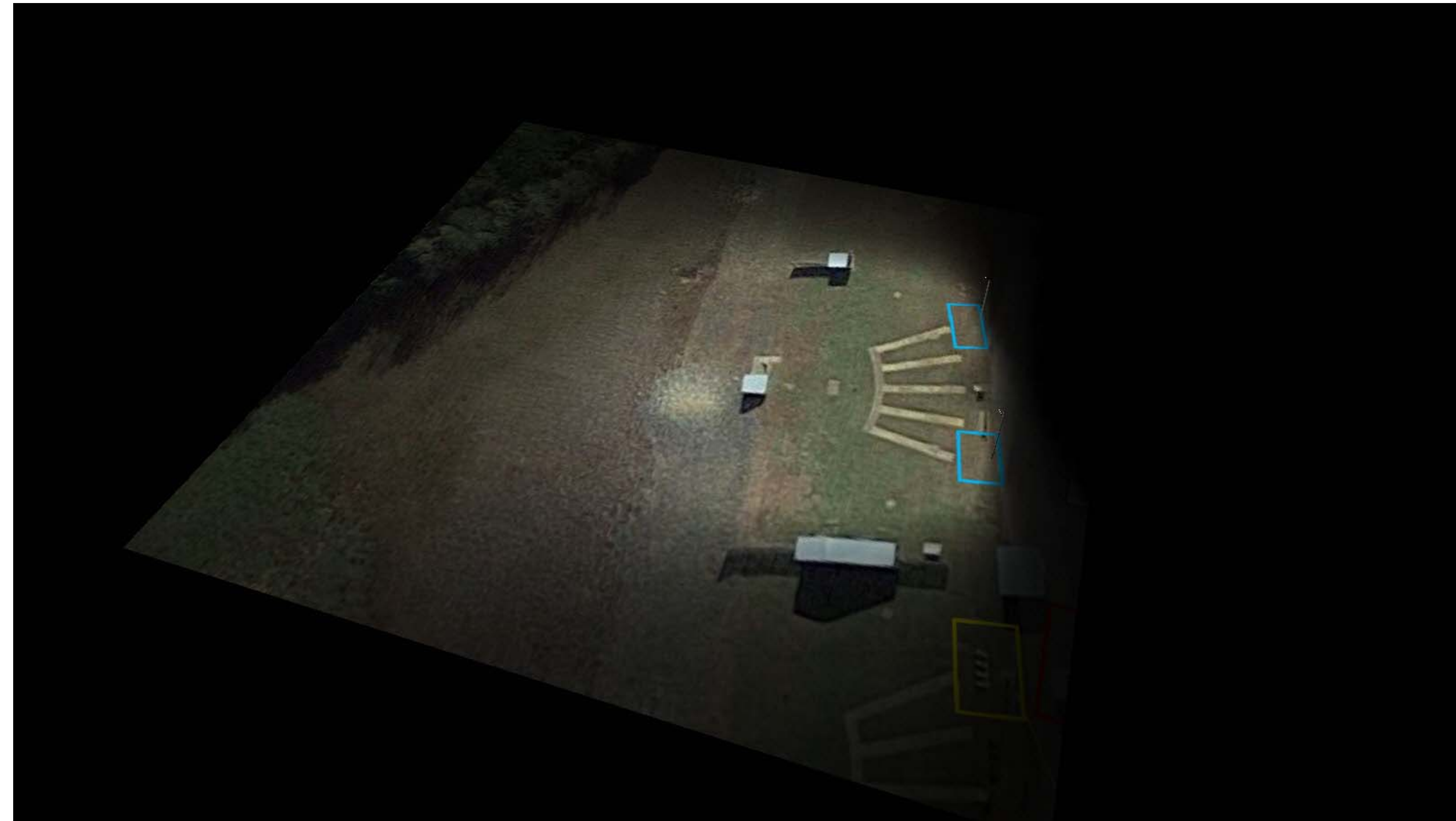
Plan View - Image from Google

Horizontal calculation point test height: 3 feet Vertical calculation point test height: 20 feet